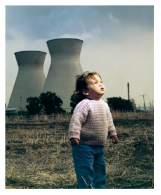
Children under five have been found, in studies, to be particularly susceptible to leukemia when living close to nuclear power plants. The closer the proximity, the higher the risk. (Photo: courtesy of J. Kamien. Hard Rain Project. © J.Kamien, UNEP.) www.hardrainproject.com.

to intense yet very short external radiation. Around the La Hague reprocessing plant, however, "people living nearby permanently breathe and eat weakly contaminated elements in their air or food chain. They absorb very low levels but continuous doses of radiation inside the body resulting in internal contamination which is chronic and at very low levels. This is not the same system and the same model should not be used."<sup>95</sup>