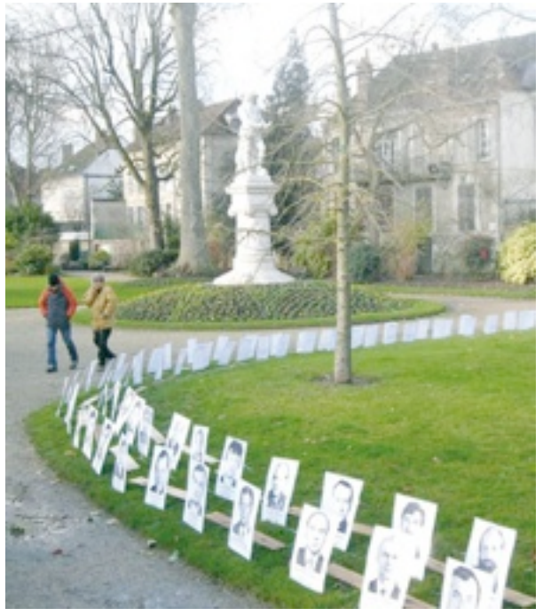
Photographs of Chernobyl liquidators