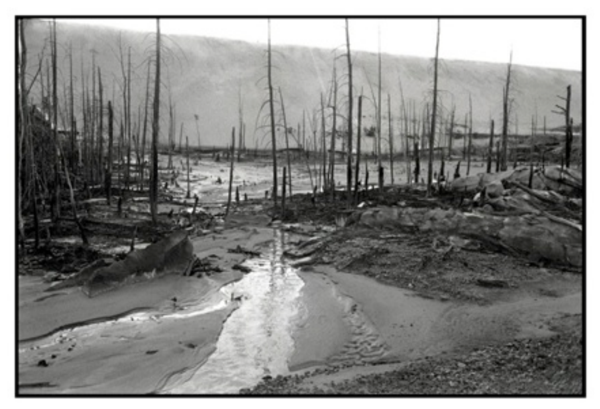
Stanrock Mill Tailings Area, Elliot Lake, Ontario, 1986. The 30-foot high wall of white sand behind the trees is made up of uranium tailings. Over 130 million tons of these tailings have been deposited in the Elliot Lake region and have contaminated the entire 58-mile long Serpent River system, finding their way into Lake Huron.