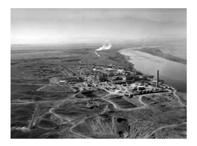
Part of the sprawling Hanford complex along the Columbia River.

The landscape in eastern Washington State is deceptively tranquil — a rural pastiche of vineyards, farms, scrub grass, ridges and windmills. But what appears peaceful and settled in the moment, has proven restive and violent over geologic time. Beneath the glacial trough of the Puget Lowland, and extending east through the Cascades to the Columbia Basin, lies a hidden landscape of geomorphic rubble — broken basalt, vast shards of continental rock, volcanic ash, and layers of ancient sediment.