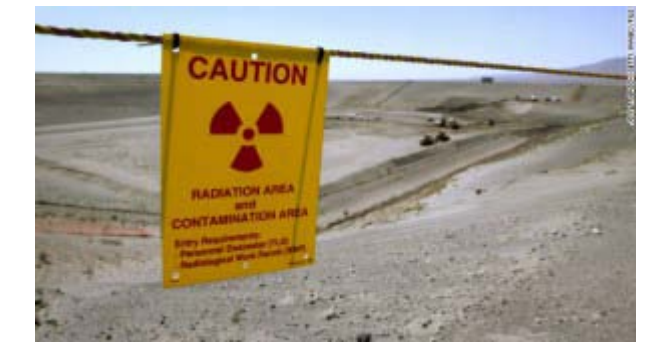
Part of the Hanford nuclear reservation.

But these pools are not just leaking radioactive fluids into the earth. On March 16, 2013, a series of hydrogen gas releases were reporting escaping into the atmosphere from a radioactive waste holding tank. Washington's KING 5 News reported the releases "lasted for several days, much longer than usual." Plant operators were reportedly concerned that "a single spark could have set off an explosive release of radioactivity." Hanford's Waste Encapsulation and Storage Facility (WESF) holds 1,936 stainless steel, 20-inch-long capsules containing 130 million curies of radioactive cesium and strontium (plus their decay products) in water-filled pools. Opened in 1979, the WESF now holds the largest concentration of strontium-90 and cesium-137 on Earth. Over the years, these deadly wastes have been left to simmer in an aging pool, beneath 13-feet of water, with no overhead containment and no safety backups in the event of an earthquake. In June, 2012, prompted by the Fukushima meltdowns, workers inside the WESF's cement-and-cinder-block warehouse were ordered to carefully rearrange the spacing of more than 800 cylinders to reduce the chance of overheating.