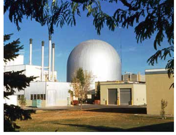
The EBR-II reactor in Idaho - the prototype 'integral fast reactor'.

attempts to treat IFR spent fuel with pyroprocessing have not made management and disposal of the spent fuel simpler and safer, they have "created an even bigger mess".<sup>31</sup>